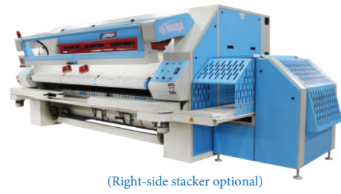
(Right-side stacker optional)