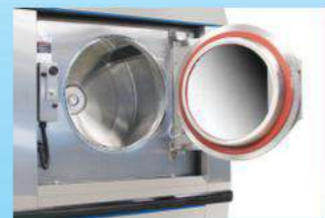
SP-130, 155, 185, 200