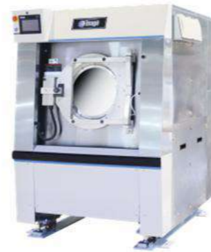
SP-130, 155, 185