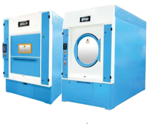
DP Series (Dryer Professional)