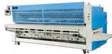
Amfold (Sheet Folder)