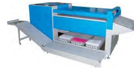
MTF (Multi Towel Folder)