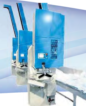
Robofeed (Automatic Feeding Station)