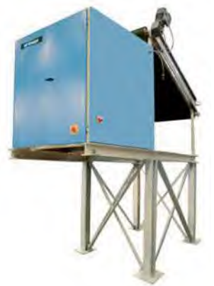
● Cake Breaker