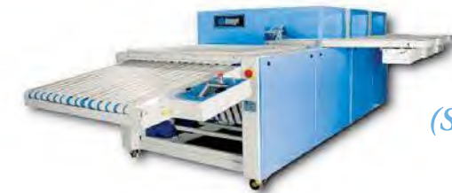
STF (Standard Towel Folder)