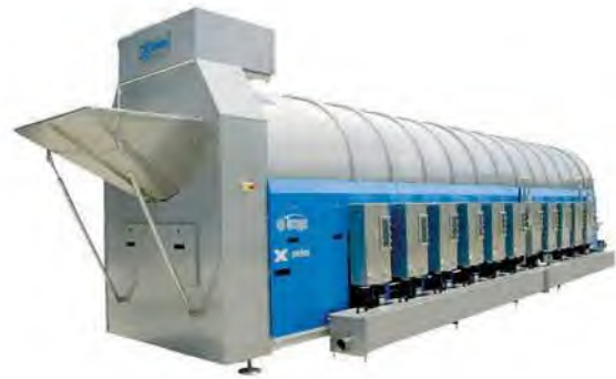
● X - Power (Continuous Batch Washer) 40,60,90, kg