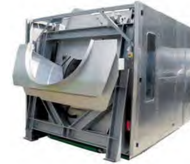
● X - Cen (Centifugal) 70 kg