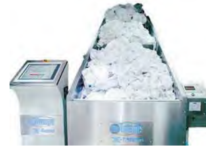
● X - Transport (Delivery Conveyors)