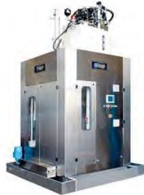
● X - Press (Single Station Press) 40,60,90 kg