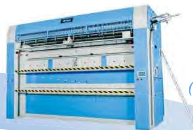
Amtran (High output Transfeed system)