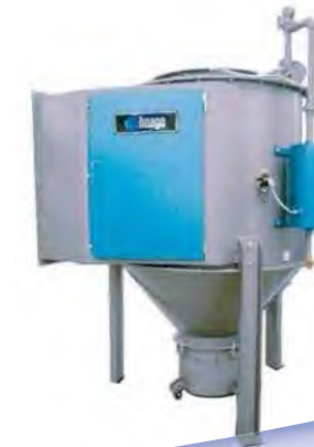
Automatic Dry Lint Filter 250, 350, 450, 650, 800, 1100 pound