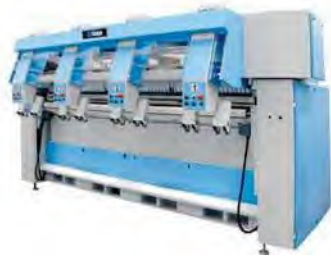
Amflex (High Production Feeder) (1- 4 Stations)