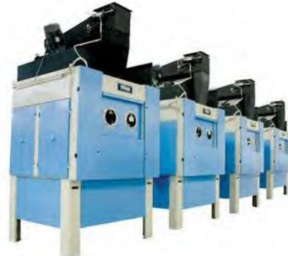
● X - Dryer (High Efficiency Dryer) 60,90,120,180 kg