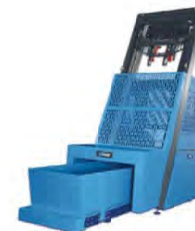
Ampicker (Sheet Separator)