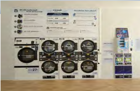
HC Series (Washer Extractor) 20,30,40,60 pound