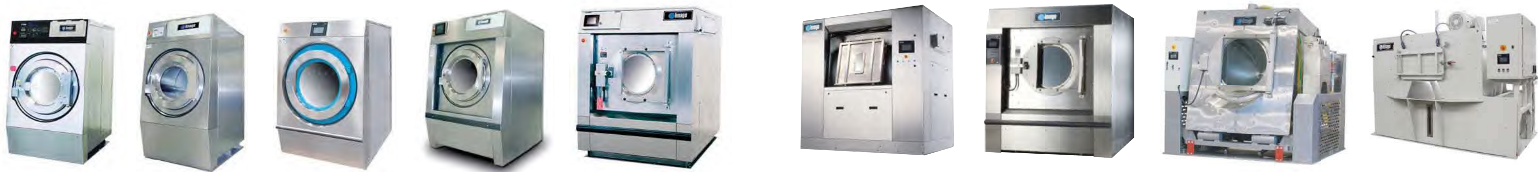
HP Series (Hardmount Professional) 60 pound