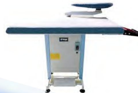
Vacuum Ironing Table