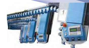
Amclip (Clipping Station)