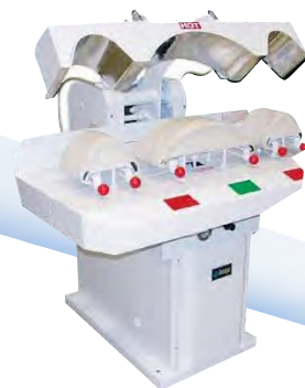
Collar & Cuff