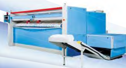
Amfold - B (Blanket Folder)