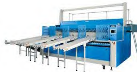
Amstack - M (Stacker for small pieces)