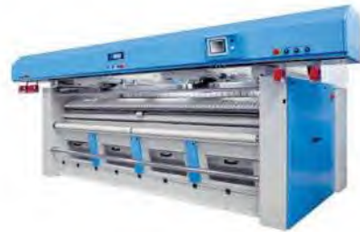
Amfeed (Simple Feeder) (1- 2 Stations)